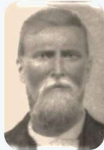
Gaston B. Cashwell (1860–1916)