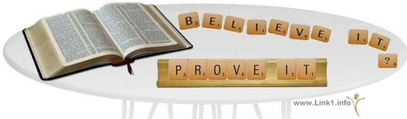
Read Acts 26:20 in several versions of the Bible.

R "...and [then] to the Gentiles, that they should REPENT and turn to God, and DO WORKS meet* for REPENTANCE." —Acts 26:20 [KJV] * Strong's definition of the KJV word, "meet," is this: "Weighing, having weight; with a genitive having the weight of (weighing as much as) another thing, of like value, worth as much."